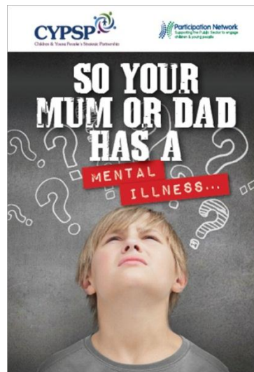
So Your Mum or Dad Has a Mental Illness: Teenagers version